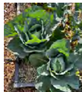
Cabbages and other brassicas are still flourishing in some garden plots

There is still some cool-weather, ready-to-pick cabbage and kale, but lettuce, herbs such as cilantro and dill, and peas are bolting (making seed) or drying up on the vine after a great run. Some gardeners get a second crop from their cilantro and dill. Dried cilantro seeds are the popular spice coriander, and dill seed is used in a variety of recipes including dill pickles. Another plus: seeds can be