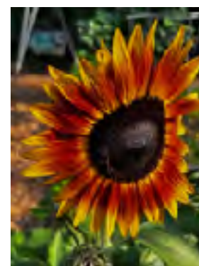
Sunflowers epitomize the beauty and utility of flowers in the garden

As garden experts advise, many gardeners are growing flowers alongside their edibles. There are many reasons to plant flowers in the garden other than their beauty. Marigolds, for example, combat harmful nematodes in the soil; their flower petals are edible; and they attract beneficial insects including pollinators such as bees and butterflies. Other winners in attracting pollinators are zinnias, sunflowers, and native flowers from our butterfly garden. Many flowering plants have culinary and medicinal uses as well.