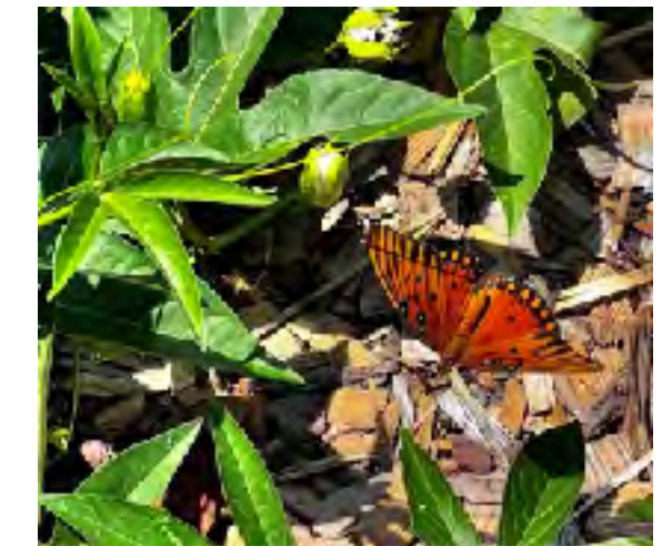
First of the year Gulf Fritillary butterfly on passionvine