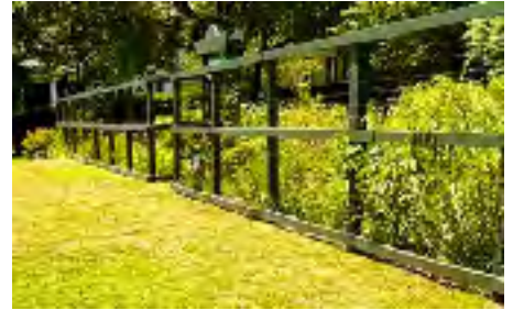
Many Butterfly Garden plants are now located inside the new fence section

When the new, taller garden fence section was added in December, many plants had to be cut back and some inevitably destroyed in the construction process. A major change was that the butterfly plants outside the fence facing the field were relocated to inside the fence in order to protect them from soccer ball and other damage. It was difficult to anticipate how the final result would look once plants began growing again in the Spring. Well, the verdict so far is that the Butterfly Garden is back and recovering beautifully. Adjustments will continue to be made to ensure that the garden is better than ever for the enjoyment of human visitors and for the welfare of the pollinators and native plants (that are its main reason for existing).