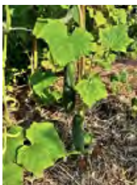
Harvesting cucumbers began in May in this garden