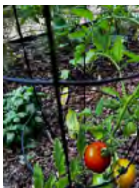
Tomatoes and basil make good companion plants for the garden and the table

Looking ahead into June we are anticipating an abundance of juicy, ripe tomatoes, eggplants, peppers, beans, and more to add to the list.