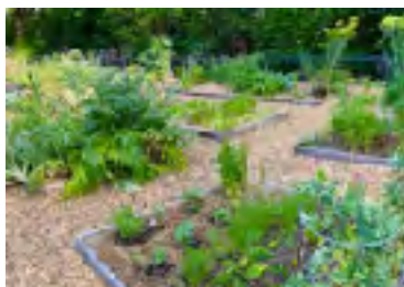
The Community Garden is picture-perfect with thriving plants of all kinds

Warmer weather is upon us and community garden plots are filled with a variety of healthy, thriving plants. The garden is in transition, however, as we move from Spring into Summer.