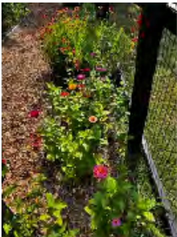
Zinnias, Scarlet Salvia, and Blanket Flowers are among the plants now growing inside the fence

Come see for yourself and watch our garden grow over the summer. Oh, more butterflies are showing up too! April Gordon ( dr.aprilgordon@gmail.com )